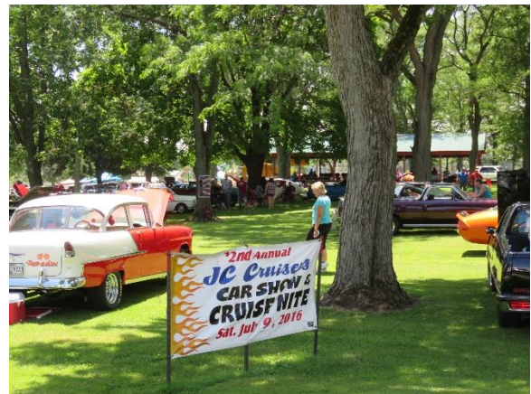
JC Cruisers Car Show at Brookside Park Prior to the Cruise Night Drive Around Rensselaer