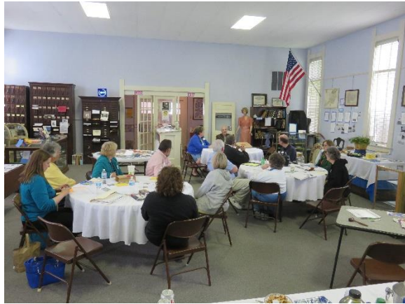
Bicentennial Meeting at JCHS