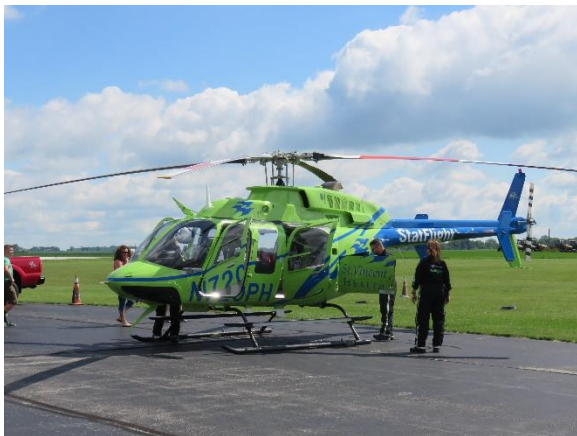
St. Vincent's Medical Chopper at E A A Chapter 828 Fly In at Jasper Co. Airport