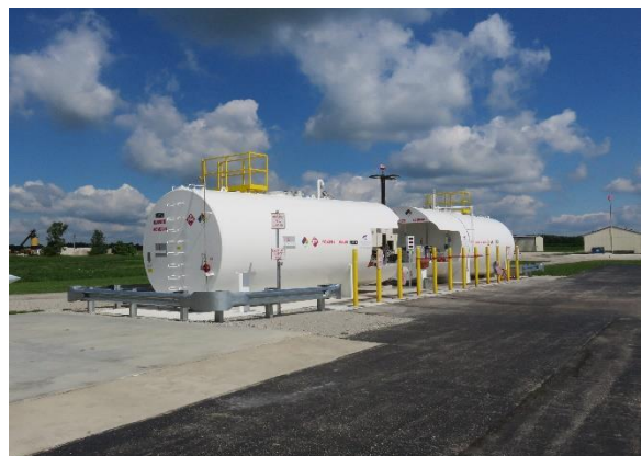
Dedication of New Fuel Field at JC Airport