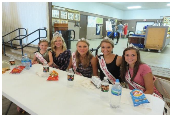
Queen and Court at Jasper Co. Fair