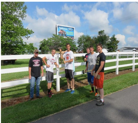
Swine Club Repairing Fairground Fences