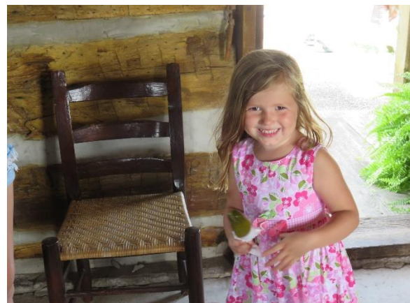
Little Guest With Pickle at JCHS Log Cabin