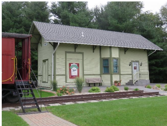
DeMotte Historical Society Train Depot Museum