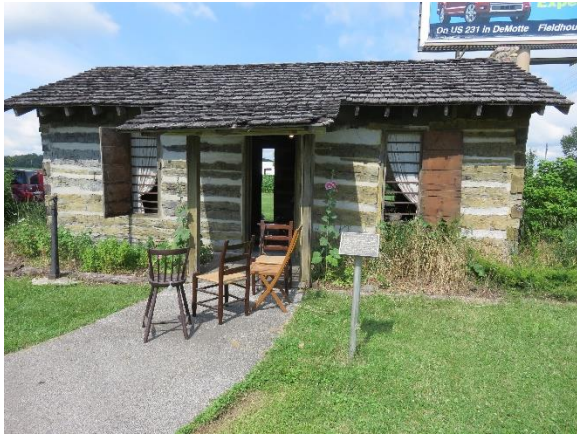
Clean-Up Day at JCHS Log Cabin