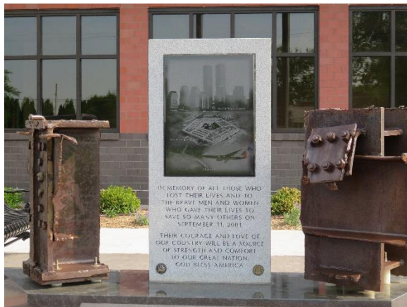
9-11 Memorial Moved to Rensselaer Fire Department's New Building