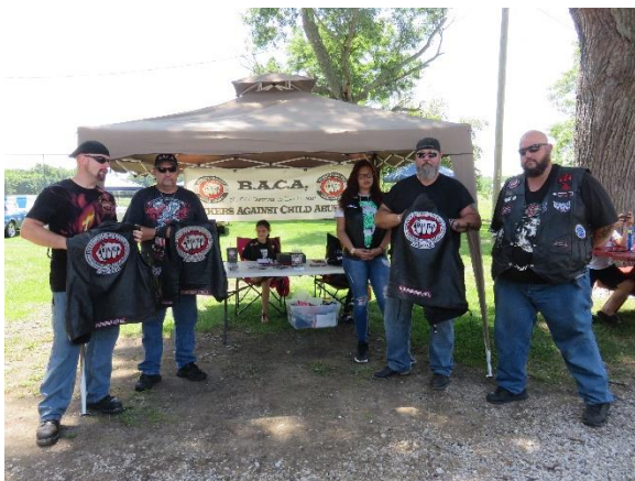
Bikers Against Child Abuse at J C Cruisers Show