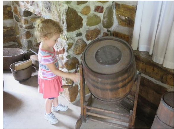
Trying to Churn at Log Cabin