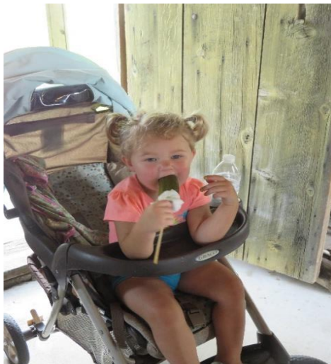
Guest Enjoying Pickle at JCHS Log Cabin